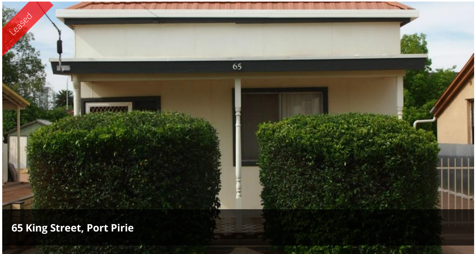
65 King Street, Port Pirie