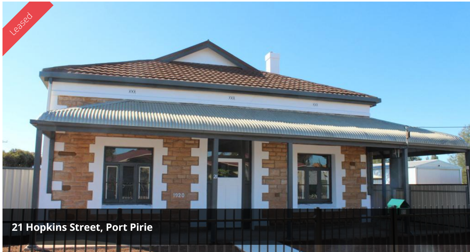
21 Hopkins Street, Port Pirie