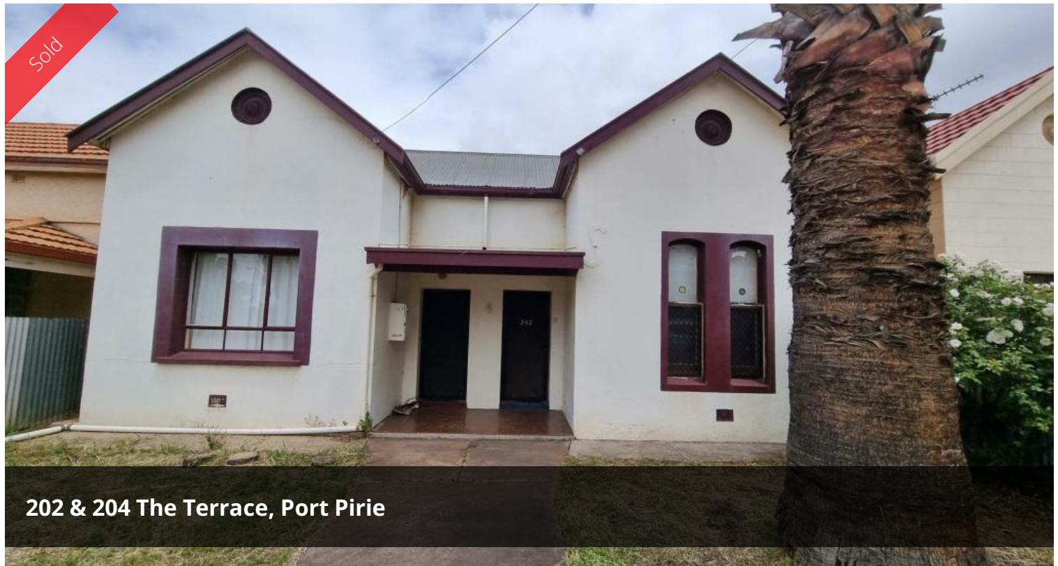
202 & 204 The Terrace, Port Pirie