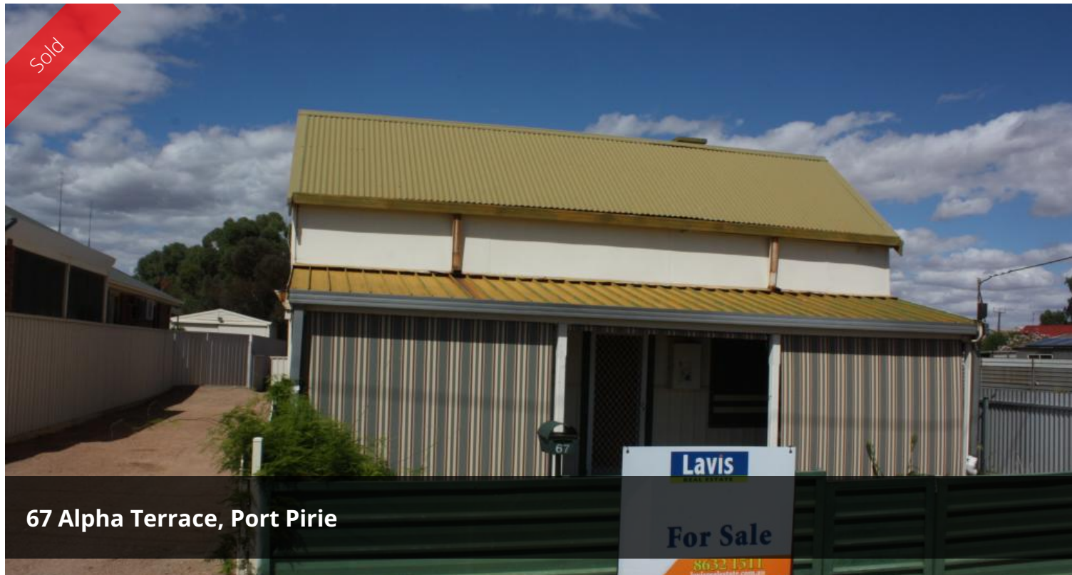
67 Alpha Terrace, Port Pirie