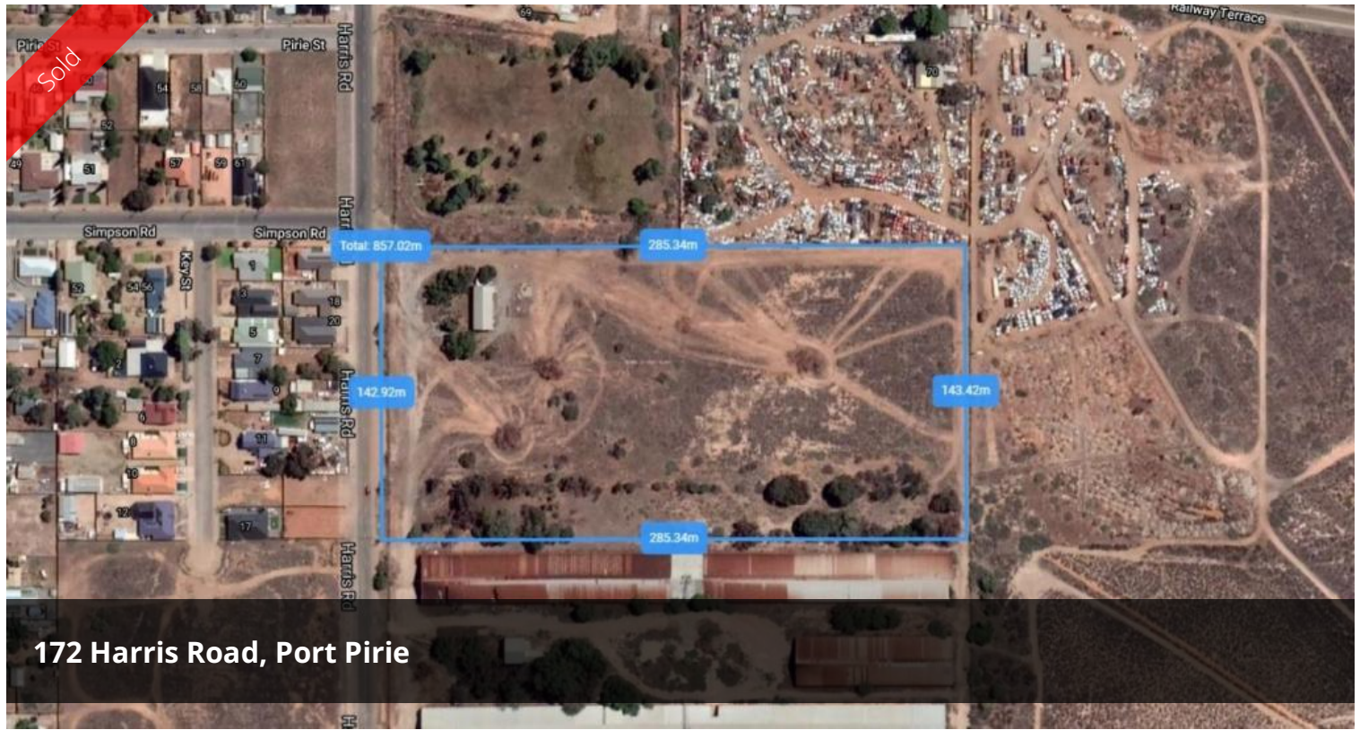
172 Harris Road, Port Pirie