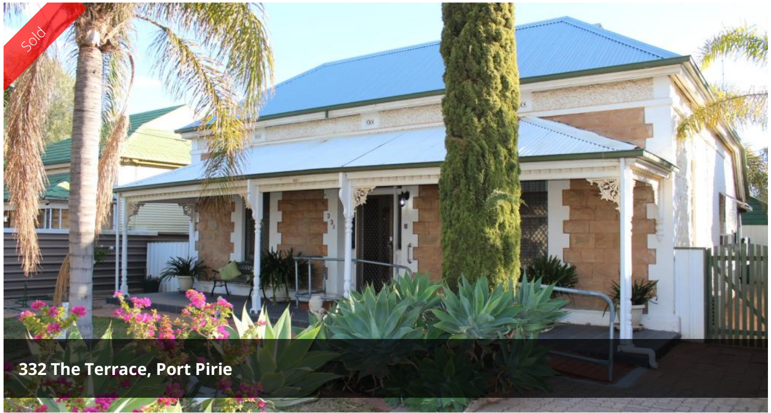
332 The Terrace, Port Pirie