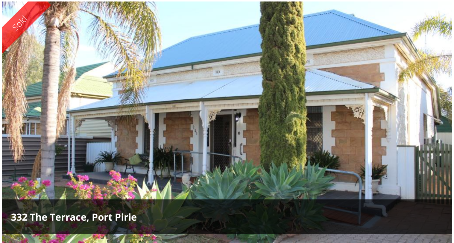
332 The Terrace, Port Pirie