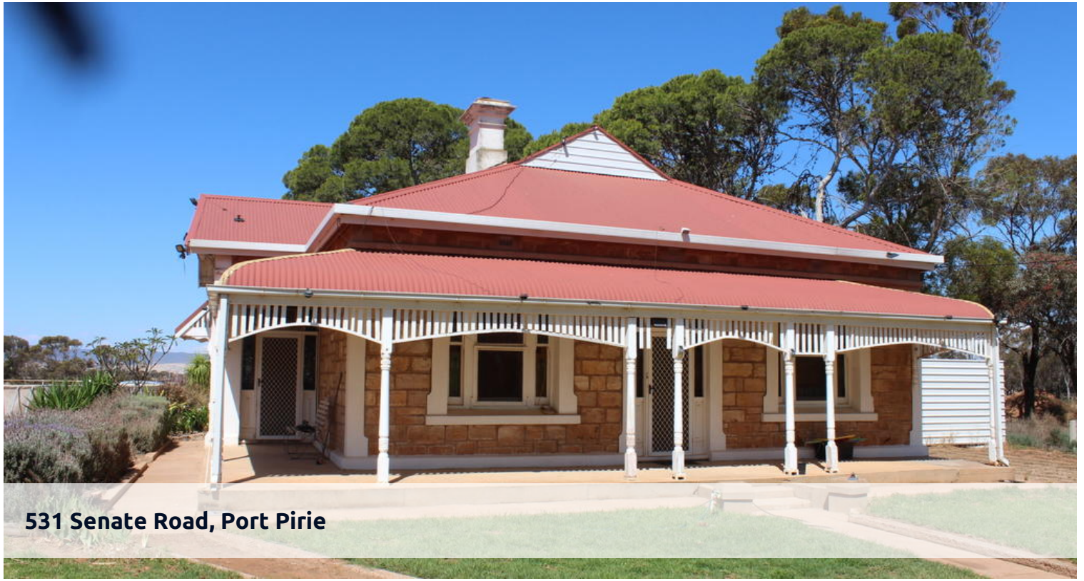
531 Senate Road, Port Pirie