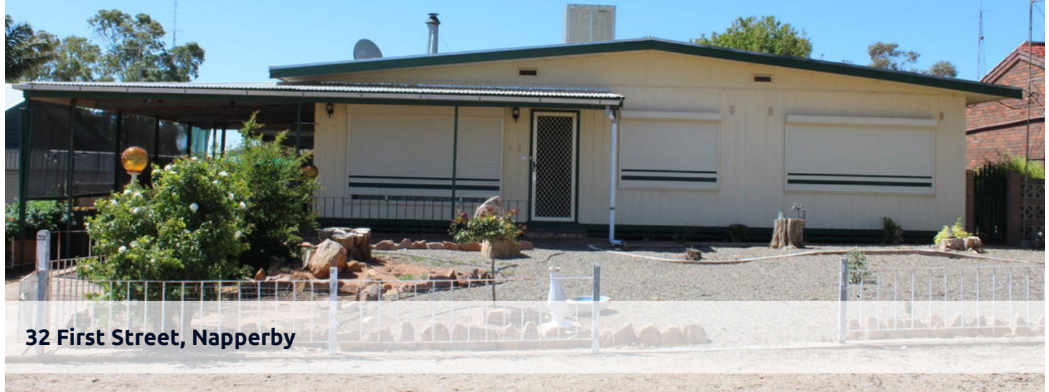
32 First Street, Napperby