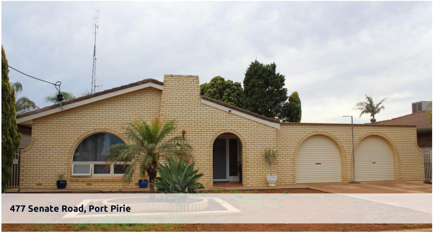
477 Senate Road, Port Pirie