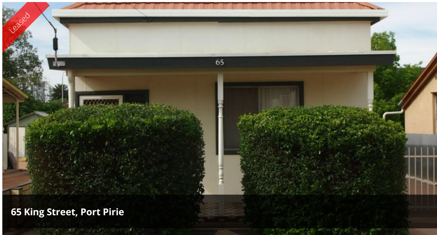
65 King Street, Port Pirie