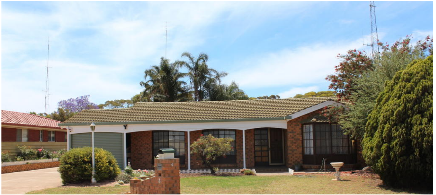
4 Acacia Street, Port Pirie