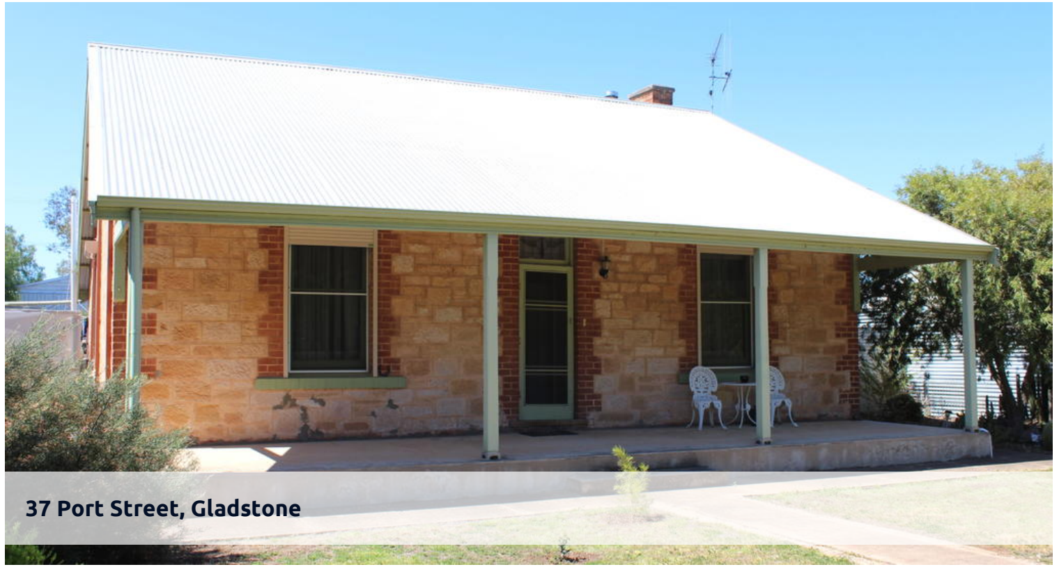
37 Port Street, Gladstone