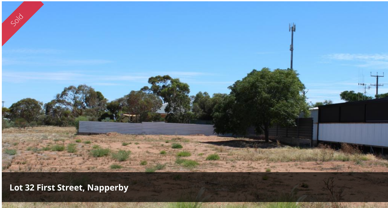
Lot 32 First Street, Napperby