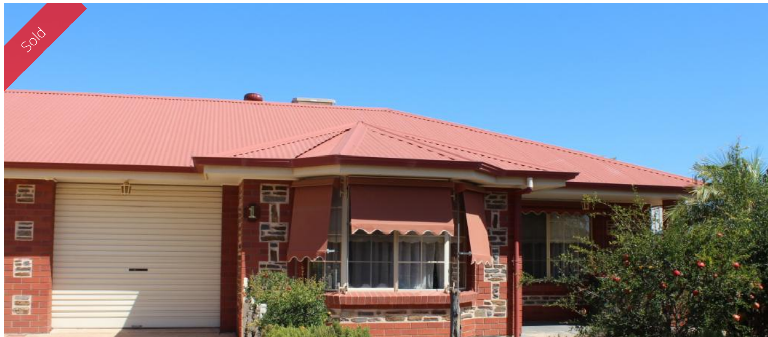
Unit 1, 2 Flett Street, Port Pirie