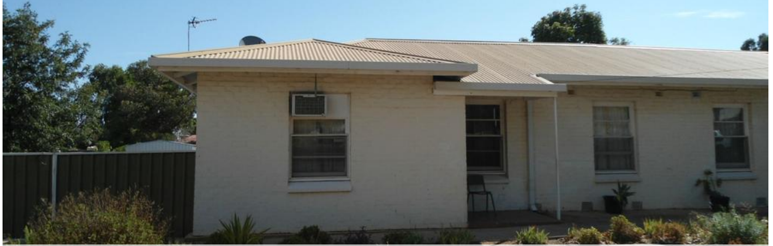
8 Giles Street, Crystal Brook